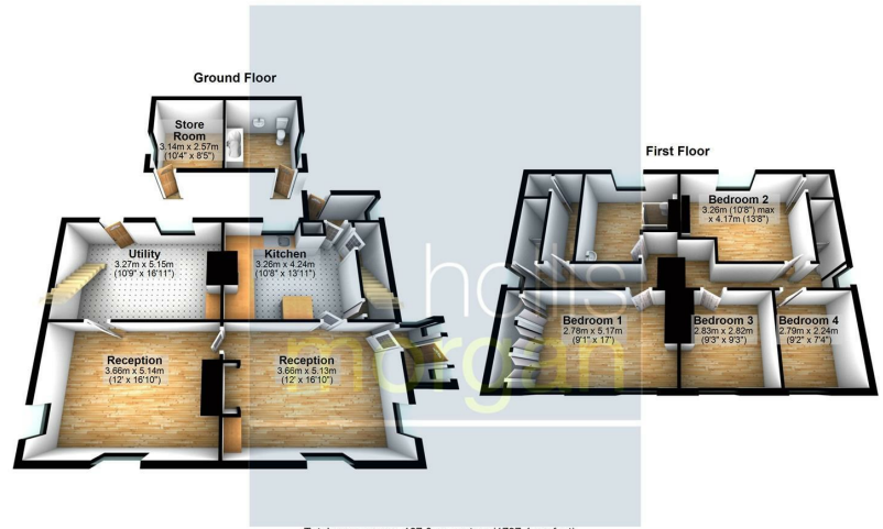
Illustration for identification purposes only, measurements are approximate, not to scale. Floorplan Produced by Westcountry EPC Plan produced using PlanIt.